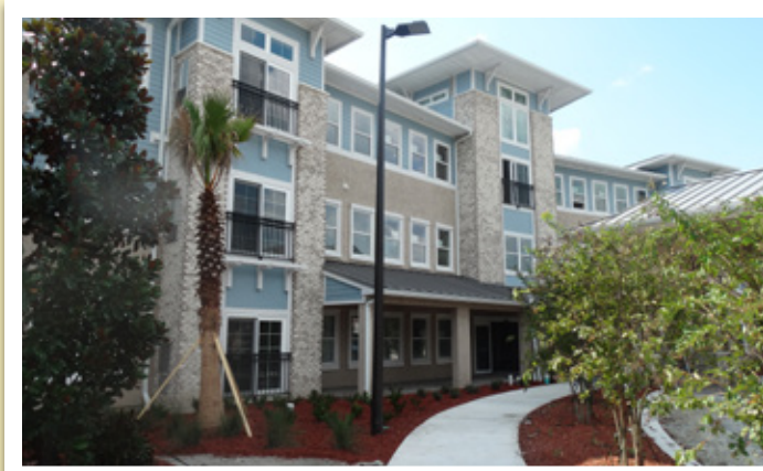
Exterior of HarborChase of Mandarin