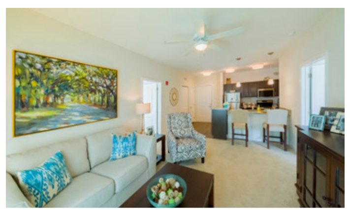
Model of 2 Bedroom Independent Unit