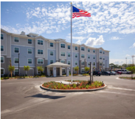
Mary Eaves, an 80-unit community in Jacksonville, Florida