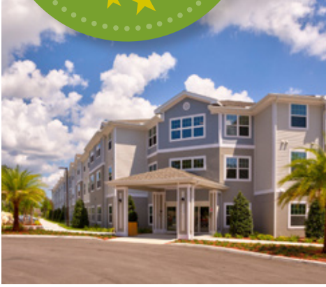
Abigail Court, a 90-unit community in Port Richey, Florida

Abigail Court and Mary Eaves, both affordable senior communities, opened this August. Amenities at both communities include an activity room with kitchen, fitness center, movie theatre, living room with fireplace, a dog park, outdoor gardens and a courtyard pavilion with grills.