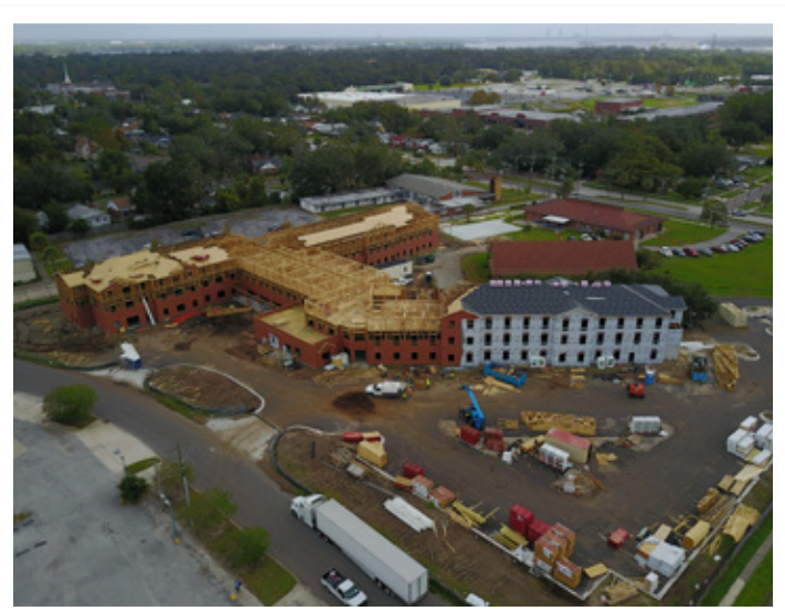
Aerial of Sulzbacher Village