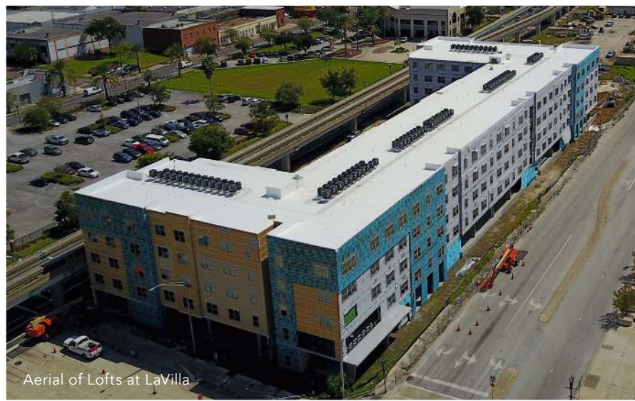
Aerial of Lofts at LaVilla

Lofts at LaVilla, a 130-unit affordable housing community in downtown Jacksonville is expected to be complete in December. The topping out of the community was celebrated in July and the community is 100% preleased with a waiting list. The demand for Lofts at LaVilla is one of the reasons why Vestcor decided to develop a second Lofts community just a few blocks away, Lofts at Monroe.