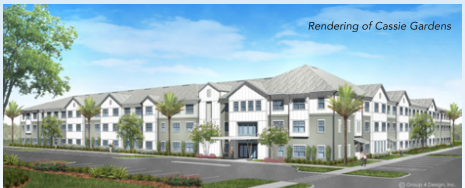
Rendering of Cassie Gardens

This fall, Vestcor broke ground on two affordable senior communities, Carter Crossing and Cassie Gardens. Carter Crossing, a 93-unit community, located in Milton, Florida and Cassie Gardens, a 96-unit community, located in Middleburg, Florida are expected to be complete in the fall of 2018. Amenities at both communities include a fitness center, living room, activity room with kitchen, movie room, outdoor garden, dog park and pavilion with grills.