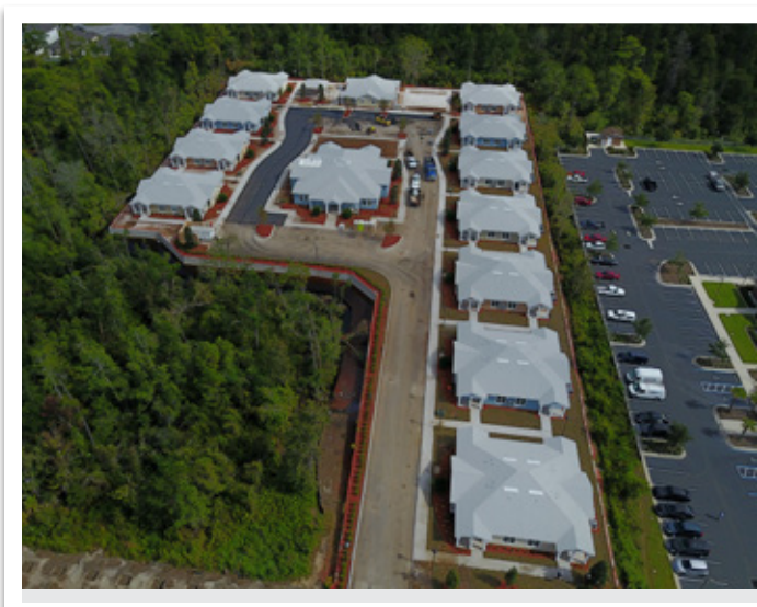
Aerial of Quest Village

Sulzbacher Village, located in the northside of Jacksonville held a topping out ceremony in October. Sulzbacher Village will provide affordable housing to single women, female veterans and families. Amenities will include a state-of-the-art pediatric health center with primary care, dental, vision and behavioral health services, a therapeutic early learning center, a female medical respite unit, and a children's program including a computer lab, fine art, homework support and mentoring services. The community is expected to be complete in April, 2018.