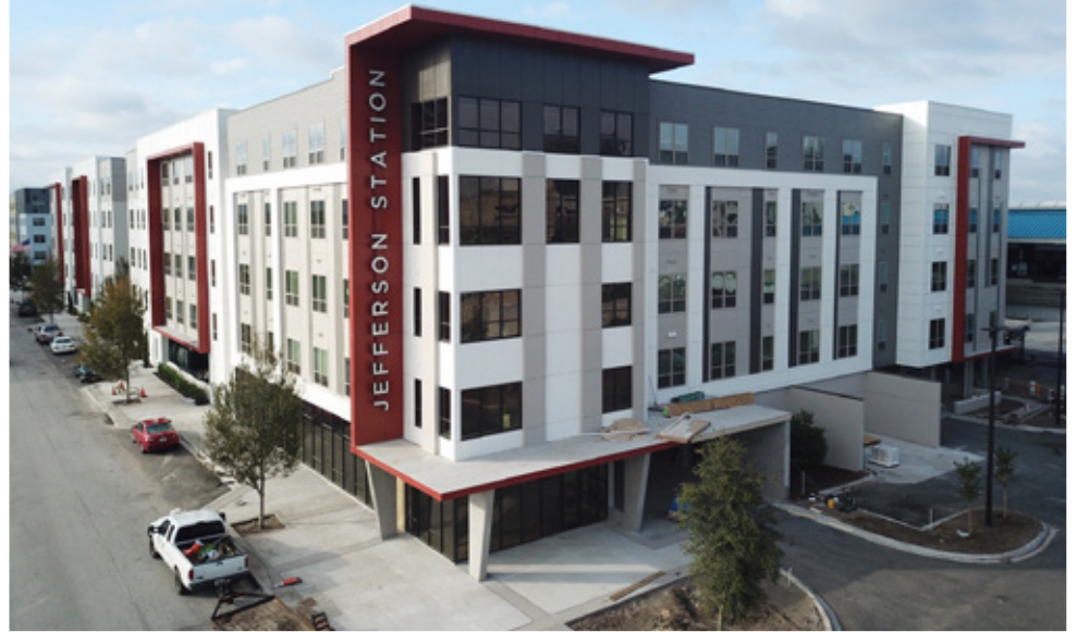
Construction Progress of Lofts at Jefferson Station