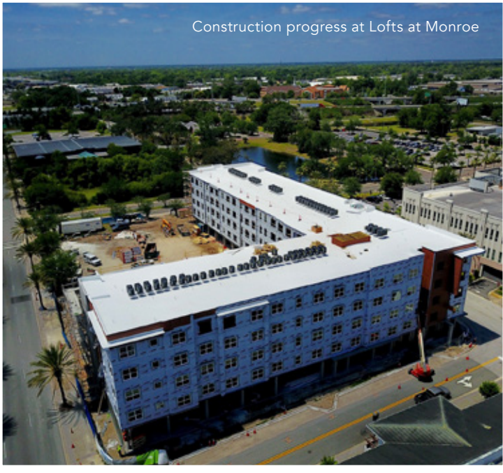
Construction progress at Lofts at Monroe

Vestcor's second community in the LaVilla area of downtown Jacksonville, Lofts at Monroe, is expected to be complete in October. The topping out of the community was celebrated in April and leasing is well underway.