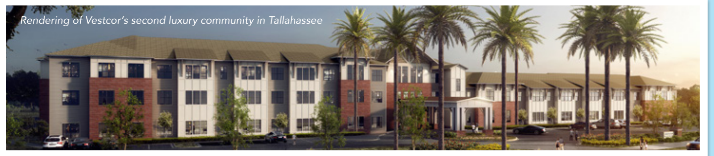
Rendering of Vestcor's second luxury community in Tallahassee

Vestcor recently broke ground on a second luxury senior community in Tallahassee that is expected to be completed in the summer of 2019. This independent, assisted living and memory care community will include multiple dining venues with an exhibition kitchen, bistro lounge with full service bar, salon, spa, fitness center, library, business center, dog park and resident gardens. Residents will also have access to over 4.4 miles of nature trails and the 14-mile Miccosukee Greenway.