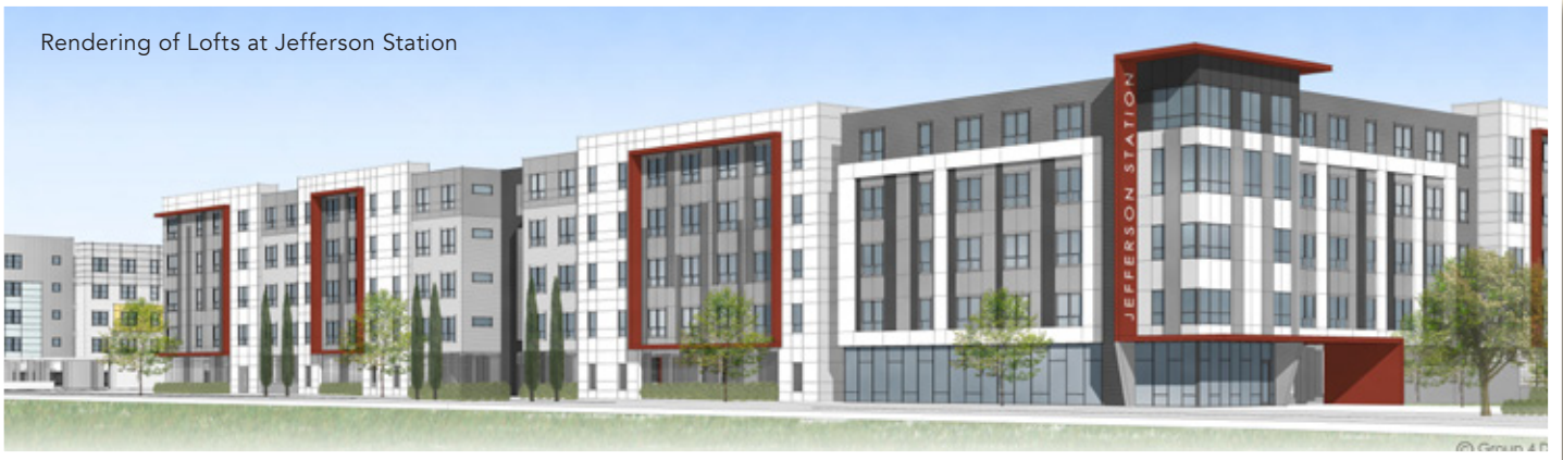
Rendering of Lofts at Jefferson Station

Due to the high level of interest received for Lofts at LaVilla and Lofts at Monroe, Vestcor is breaking ground on a third community in LaVilla, Lofts at Jefferson Station, this summer. Lofts at Jefferson Station will be located adjacent to Lofts at LaVilla and will consist of 133 studio, 1-bedroom, 2-bedroom and 3-bedroom apartments. The community will be a mix of affordable and workforce housing. Amenities will include a hospitality area, internet café, fitness center, outdoor amenity areas and a resident lounge on the fifth floor overlooking downtown.