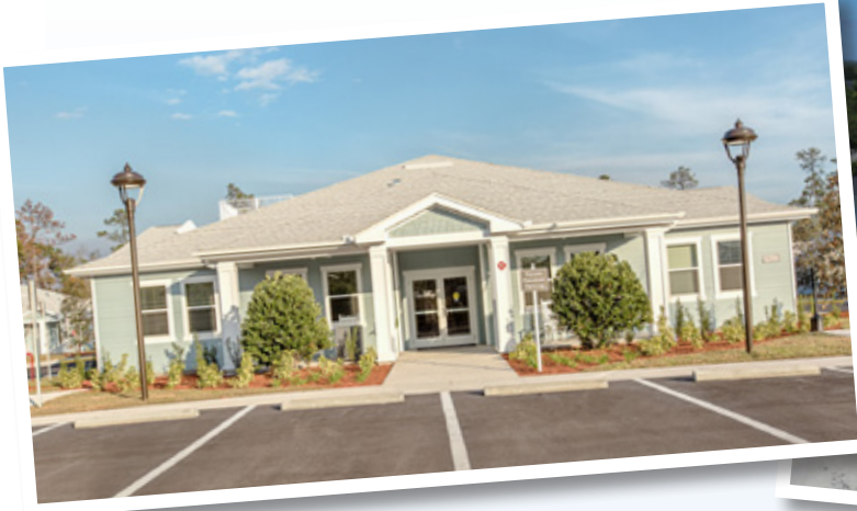
Quest Village Exterior