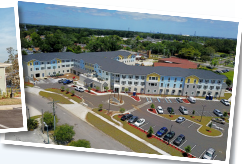
Sulzbacher Village Exterior