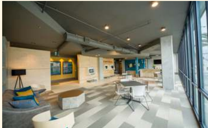
Interiors from Lofts at LaVilla (L-R): Clubroom, Fitness Center, Apartment, Internet Café