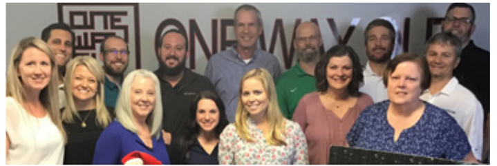
The Vestcor Team at One Way Out