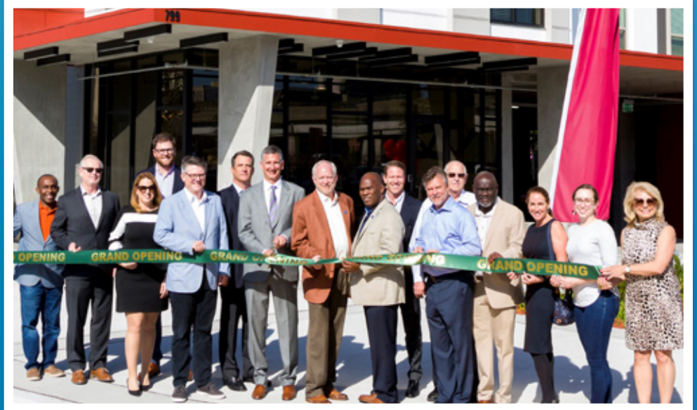
Local Officials & Business Partners at the Ribbon Cutting Celebration

Vestcor celebrated the grand opening of Lofts at Jefferson Station this January. Jefferson Station is a 133-unit affordable and workforce housing community located on Water Street adjacent to the Jefferson Station skyway station. This is our third “Lofts” community in Downtown Jacksonville. Lofts at Jefferson Station offers a range of studio, one, two and three-bedroom apartments. Features include a fitness center, internet café, activity room with billiards, an outdoor amenity space with a large screen projector, a clubroom with kitchen and TVs and a dog walk area.