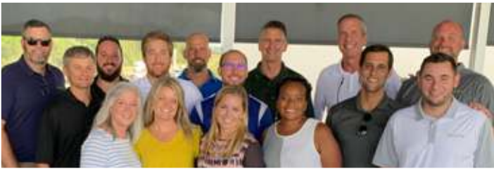
The Vestcor Team at Top Golf

Each quarter, we enjoy an afternoon of bonding as a team whether its working together to try to escape from an escape room or cheering each other on at Top Golf. These events are always a great way to get the team together to celebrate our hard work and success.