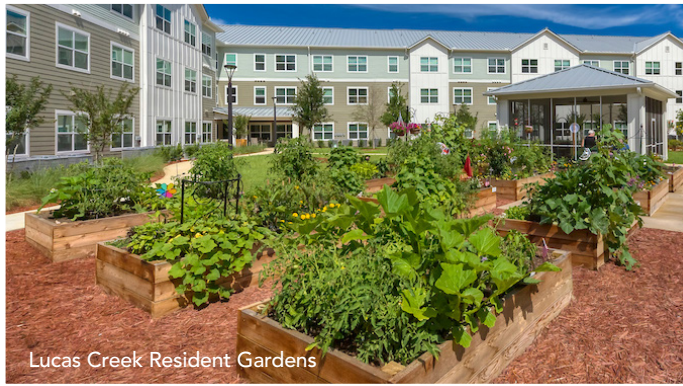
Lucas Creek Resident Gardens

Lucas Creek opened to residents on April 1st and was 100% occupied by April 30th. This 93-unit affordable senior housing community is located in Pensacola, Florida. Community features include an activity room, living room with computers, movie room, fitness center, outdoor garden, a dog park and a courtyard pavilion with grills.